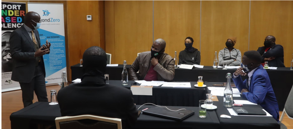
At the Men's Sector Stakeholders Meeting at Bon Hotel 3 August 2021, stakeholders invited included: